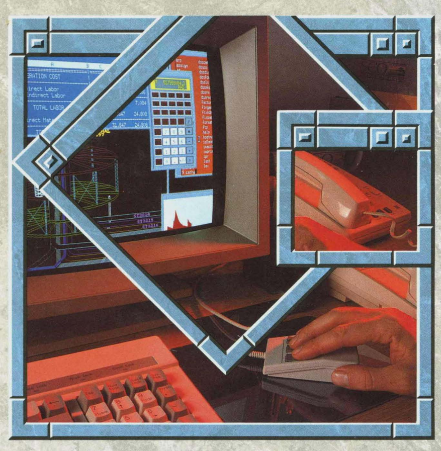
The Complete Graphical Operating System